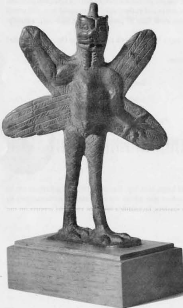
A bronze figure (about six inches high, on display in the Institute Museum) of the demon Pazuzu, who was considered responsible for some illnesses. From Iraq. About 700 B.C.

The texts are usually staid, dry, and as unexciting as the Merck Manual is to a layman. The usual format begins, for example, "If a person suffers from ringing in his ears, moisten a wad of wool with oil and put it into his ears; he may have food and beer; continue the treatment for seven days and he will recover." Various other symptoms are usually given in the subsequent text. Even when the ringing in the ears is attributed to sorcery or to the nefarious activity of a ghost, a purely medicinal treatment is prescribed using, for example, pomegranate juice. We may surmise that physicians were much more successful in treating external ailments of the ears and eyes, and sores on the skin, where the effects of the medication could be observed, than in treating internal ailments.